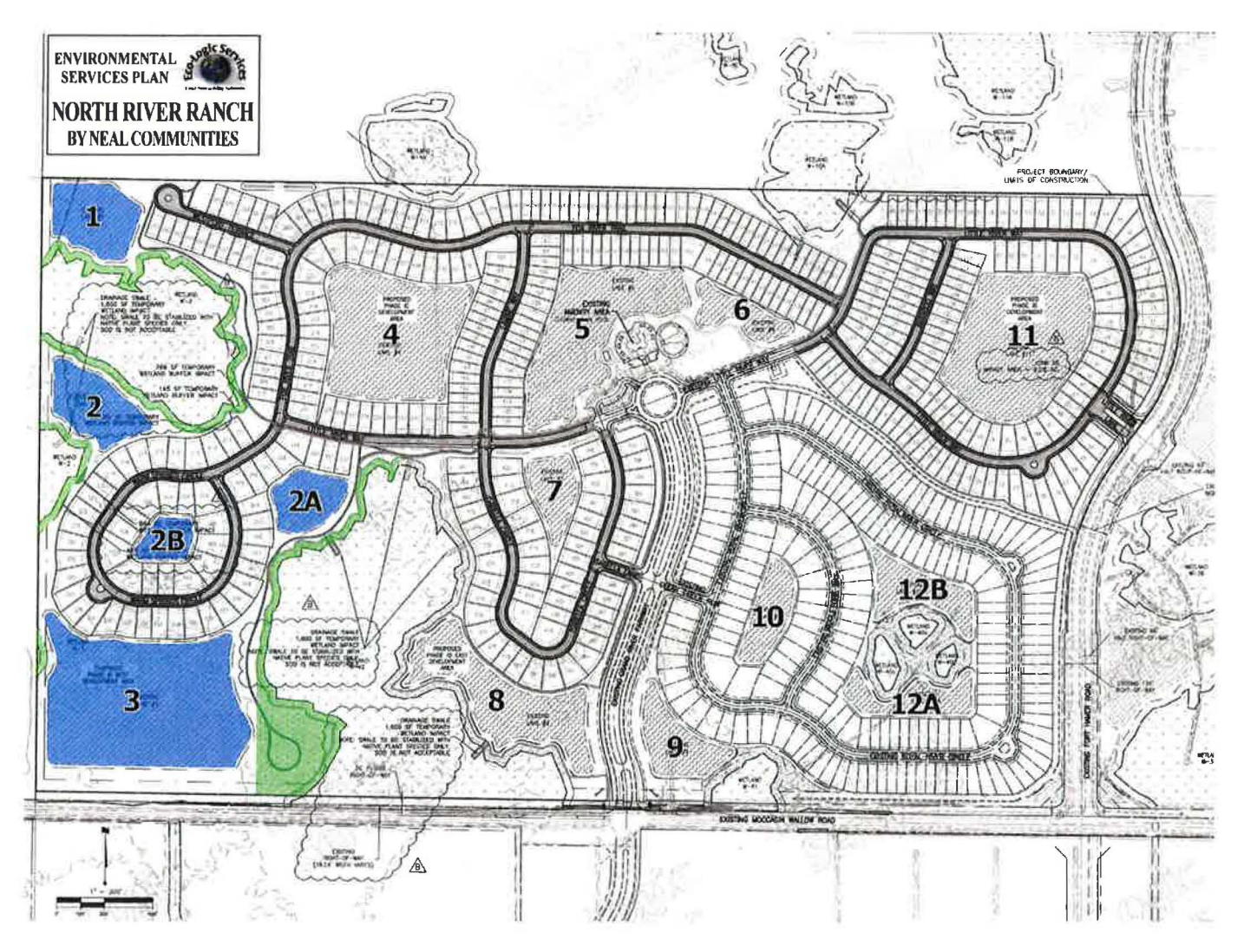
Figure 1. Site map showing the treatment areas included in this addendum.